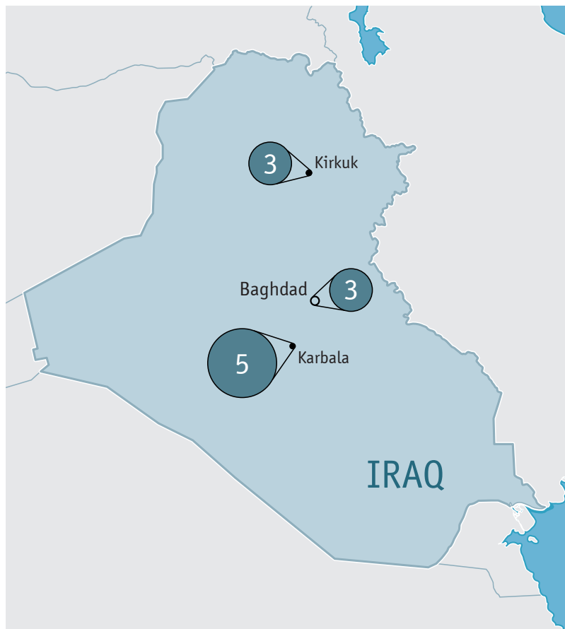
Map 1. Sessions by Province